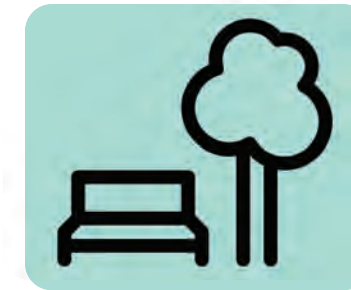
Embrace Outdoor Public Space