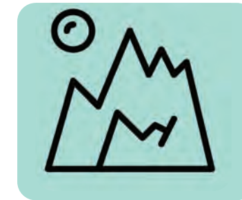
Promote Experiential Activities