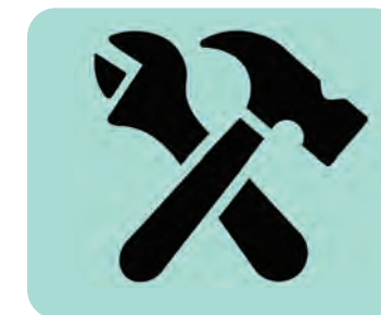
Reconfigure Retail Centers