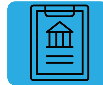
Evaluate Activity Center Zoning District