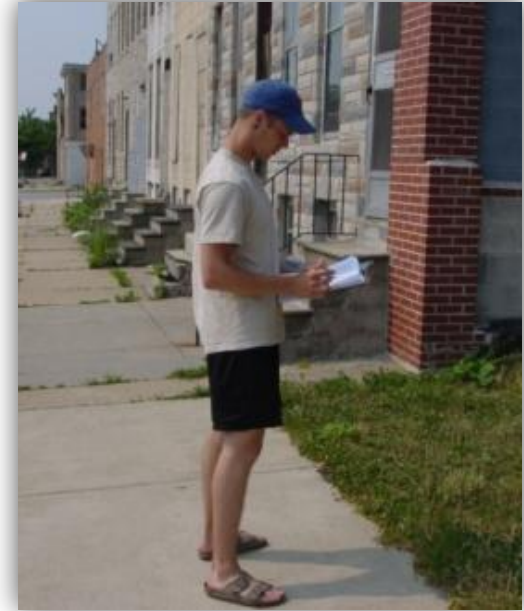
An RA collecting yard condition information in Baltimore